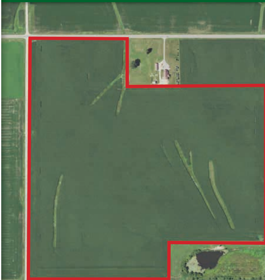
ALL LINES AND BOUNDARIES ARE APPROXIMATE.